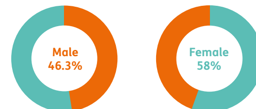
Percentage of employees receiving a bonus: